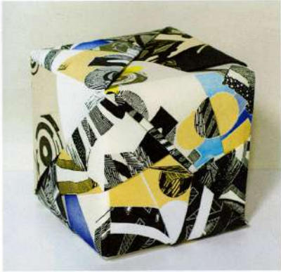
Ian Cross Columbus, OH Fabula relief monoprint