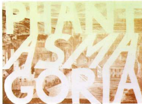
Susanna Crum Louisville, KY A Collecting Place I lithograph